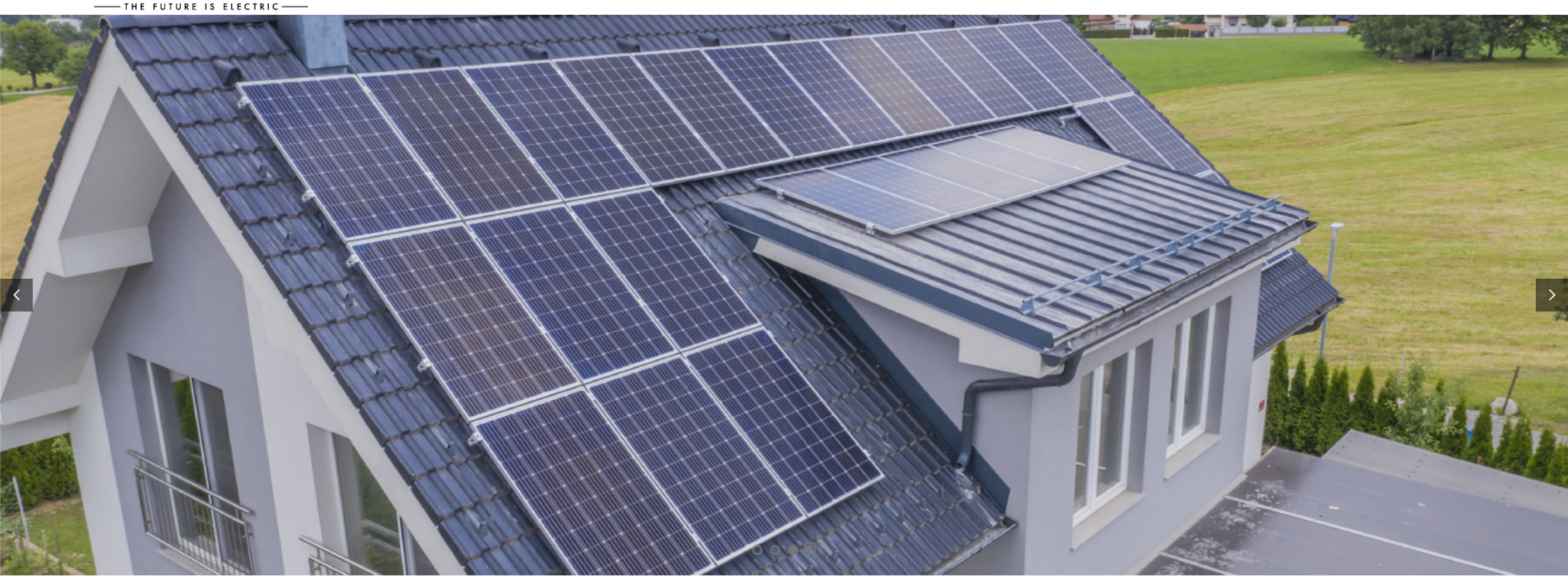
UK Solar Power Panels

It has never been easier to generate electricity from solar panels, a reliable and clean way to use solar power. How little it costs to benefit financially, reduce carbon emissions considerably and contribute to the environment may surprise you!